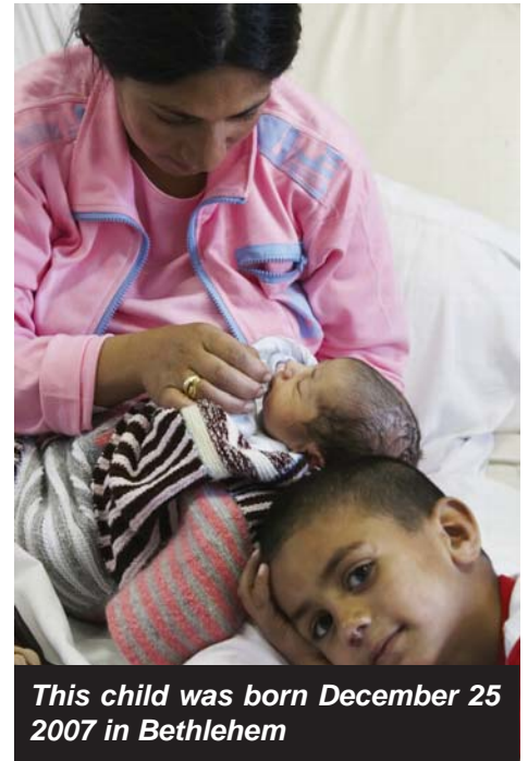
This child was born December 25 2007 in Bethlehem